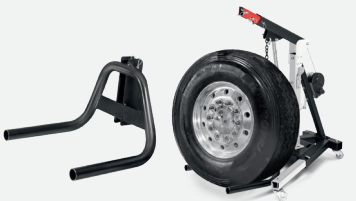
Lifting fork for wheel Ø from 60 to 120 cm 200 Kg Max

Directly lift hub and disk assemblies with the cable and hook.