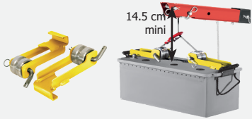
Lifting hook for battery