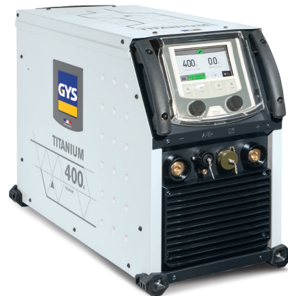
Delivered without accessories (optional trolley)