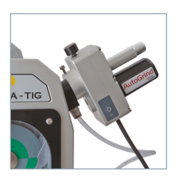
Grinding module – automatic rotation of the electrode holder