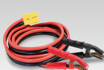
8 m - 16 mm 2 056572