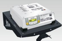
Wall shelf 055513