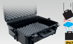
Carry case 060432