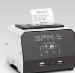
SPM : Printer module 026919